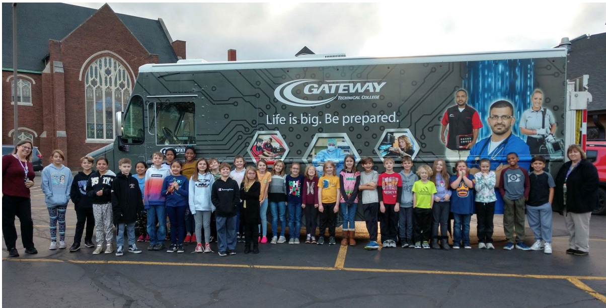
Students from Kenosha Lutheran Academy posing with the “Cert-V,” or Certification Vehicle.