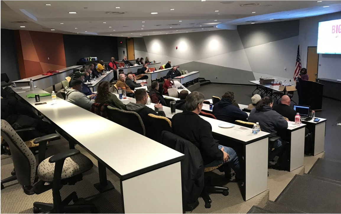
Thirty-four Facilities participants were involved in a Team Building Strengths oriented activity designed and administered by the Fab Lab, where they used 3D printed catapults to play a “Corn Hole” game.