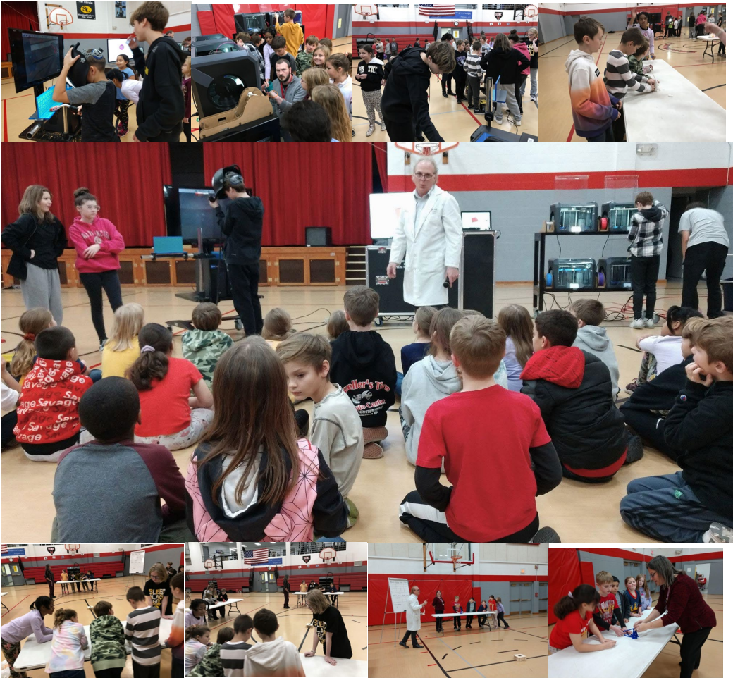
The Fab Lab also did outreach with KTEC High School this month.