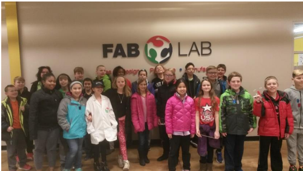
Pleasant Prairie Elementary School students visit the Fab Lab to learn about manufacturing, welding, CAD design, and 3D printing.