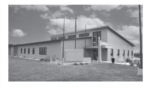
Elkhorn Campus 400 County Road H Elkhorn, WI 53121

496 McCanna Parkway Burlington, WI 53105