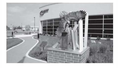
HERO Center 380 McCanna Parkway Burlington, WI 53105