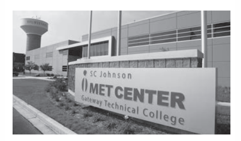
SC Johnson iMET Center 2320 Renaissance Blvd. Sturtevant, WI 53177