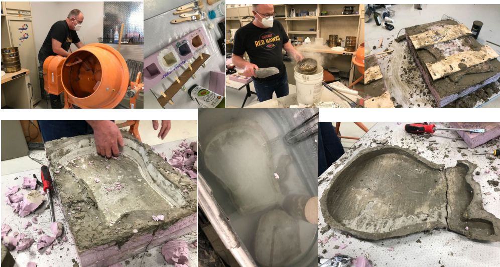
Once cast, parts must soak for a month.