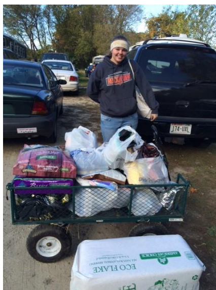
Some of the enrichment items students brought to Valley of the Kings

The Communications Department is introducing its new class for spring '16. Foundations of Writing will reduce the number of hours students spend at the lowest level of developmental writing from six to four. It will eliminate an entire semester of remediation for those at the lowest levels of reading and writing without compromising their chances of success in college-level classes. A similar change is being made on the reading side, eliminating one of the reading classes and adding hours to the remaining class to reduce the time necessary for students to complete reading remediation.