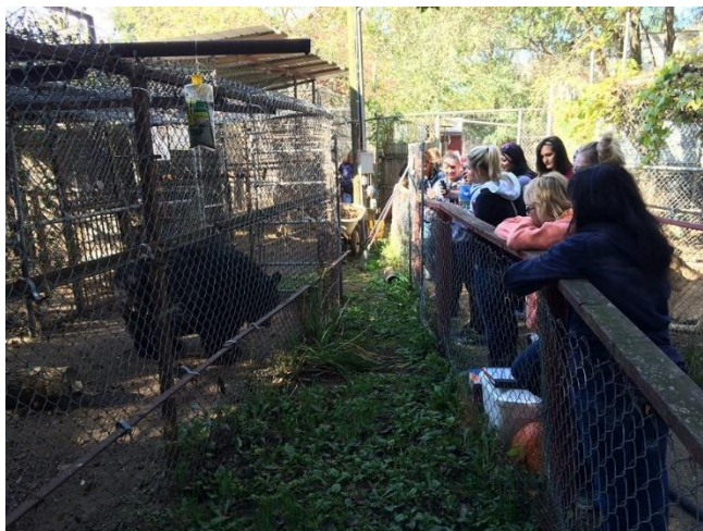
Students at Valley of the Kings, observing the animal behavior