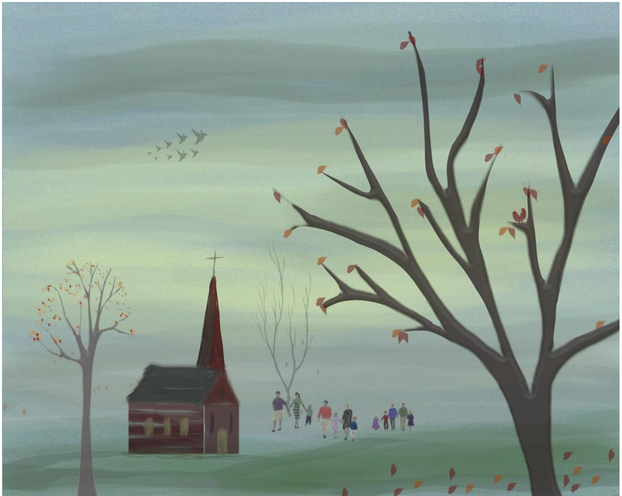
"Photography Final" by Tracy Cochran