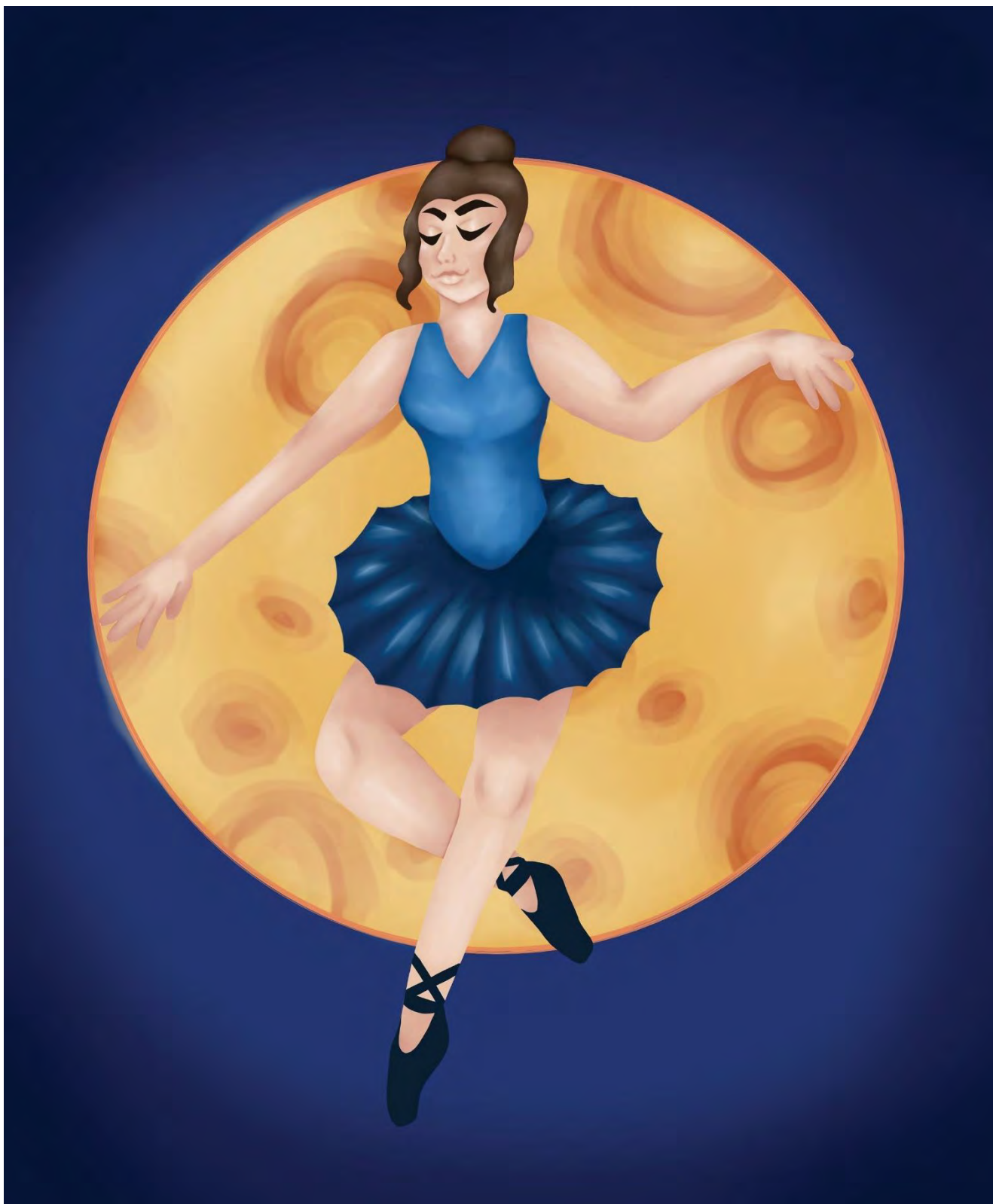
Jillian Busch – Digital Illustration