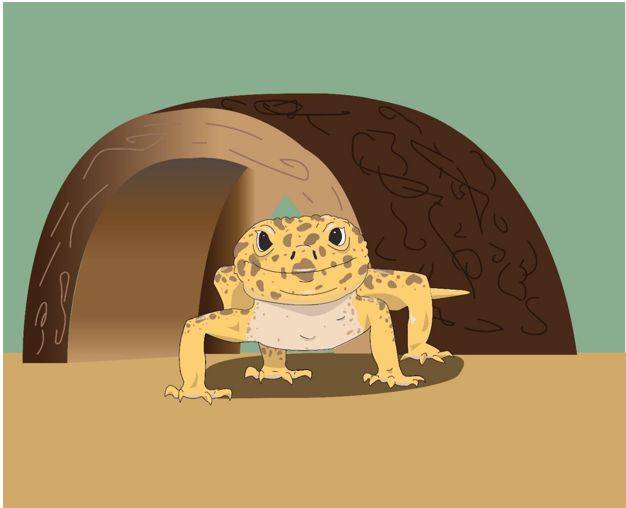
Lizard, Alyssa Bartos

The light was almost blinding in contrast to the earlier sky. The street we had taken that morning was camouflaged with whole trees and their limbs and cars propelled about in whatever way. Live wires and cables intertwined through the twisted and mangled scene. As everyone exited the safety of their homes the devastation of what they just lived through became indisputably apparent. The mutilated homes were mere shells of what they once were. It was a realization to everyone that life would never quite be the same. This hostile storm was a warning of the fragility of life. One that I strongly heeded. Changing my life forever, that day was my first memory and worst nightmare. One I hope I never have to relive, but will always remember.