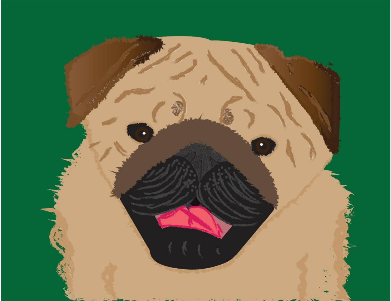
Dog, Abigayle Sura